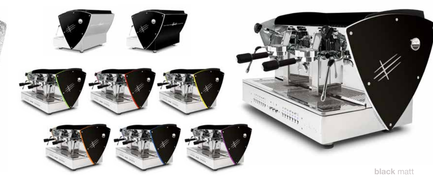
black / white / green / red / yellow / orange / blue / violet methacrylate transparent methacrylate