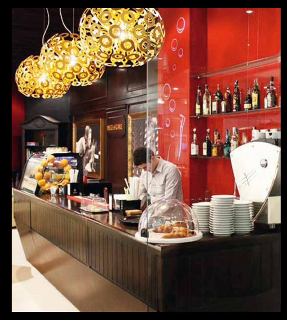
Piece of Cake - Cocor - Bucarest - Romania