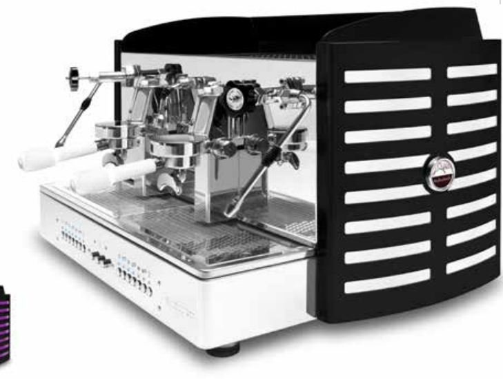
black matt white methacrylate