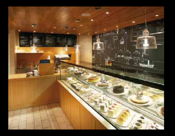
Artisée Samsung Town South Korea