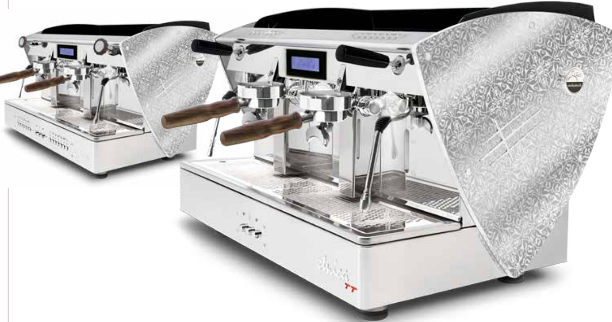
Limited Edition Sides in super-mirror steel with satin texture and nut wood handles and knobs (no joysticks)

We are always able to evaluate any kind of customization, whenever it's possible.