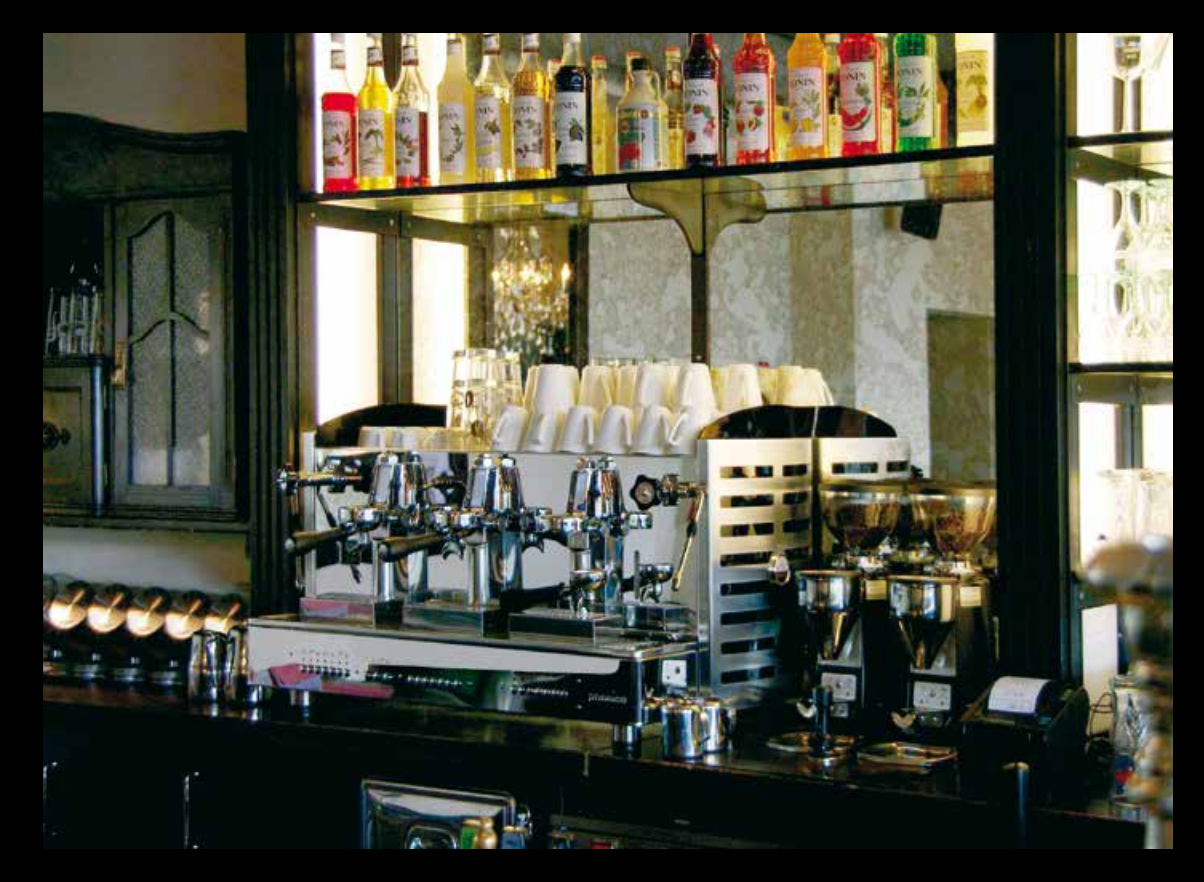
Radolfzell - Germany