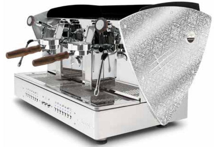
Limited Edition sides transparent methacrylate