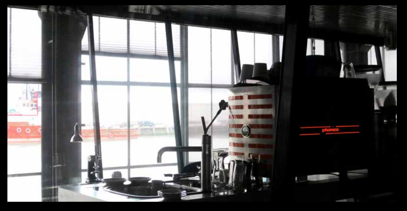
Rotterdam The Netherlands