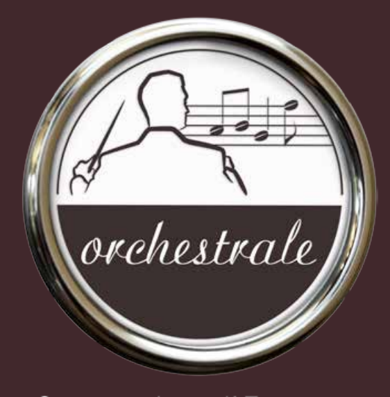
Strumenti per l'Espresso