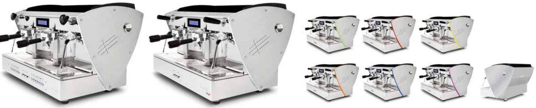
satin steel transparent methacrylate