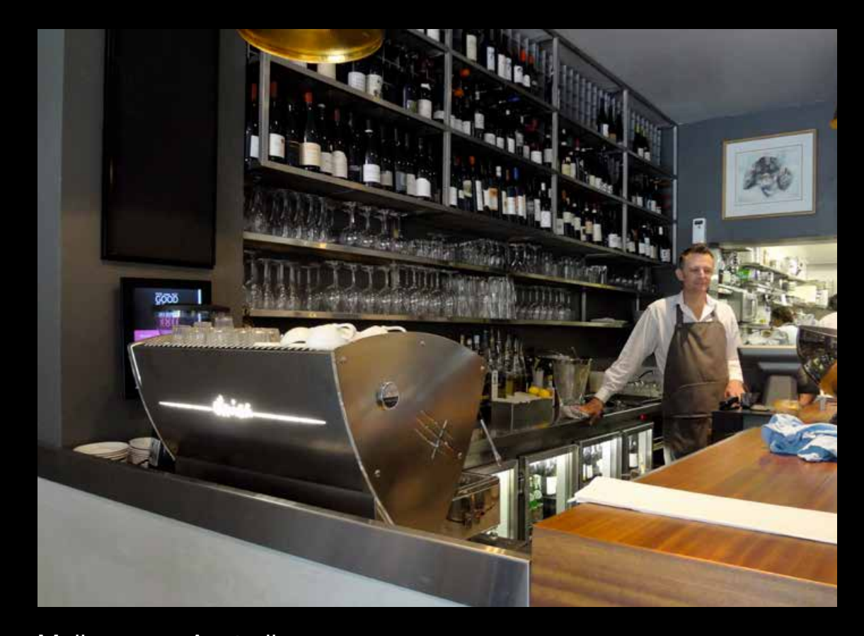
Melbourne - Australia