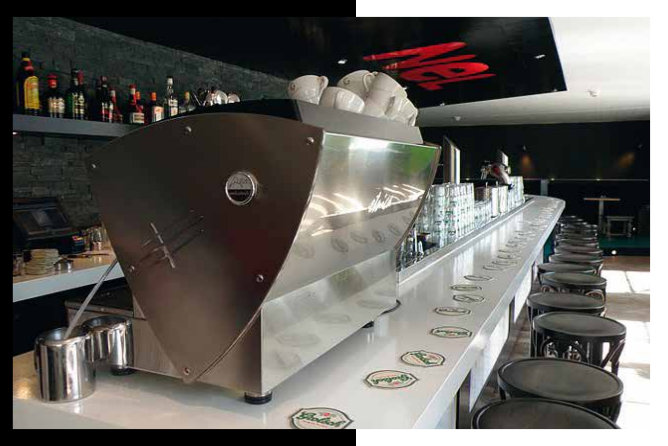
Grand Café Nel Amsterdam - The Netherlands