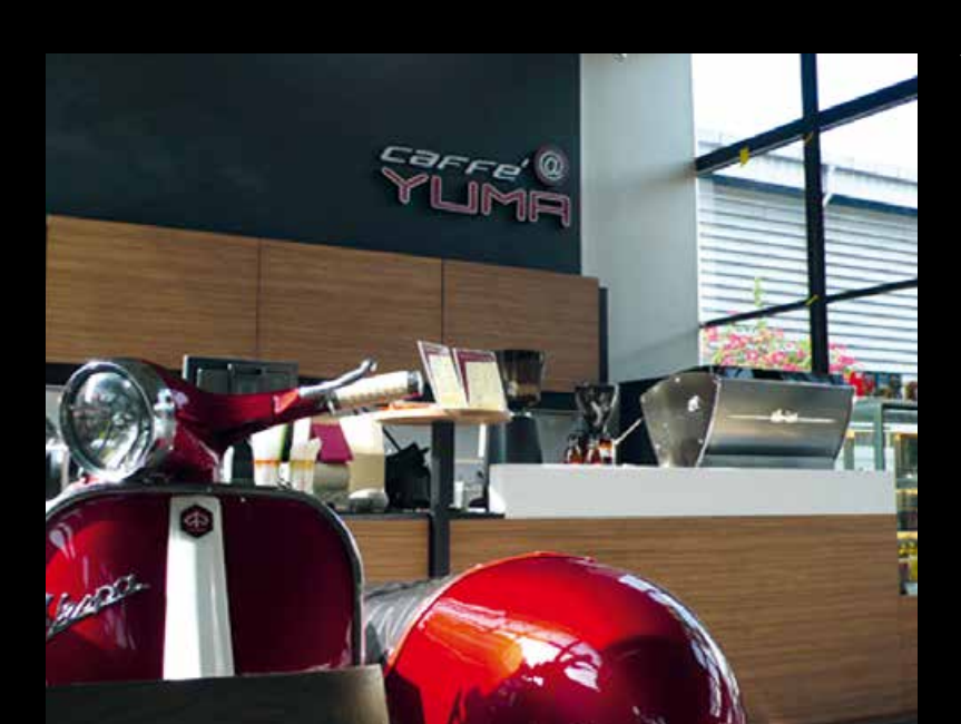
Yuma Motors - Thailand