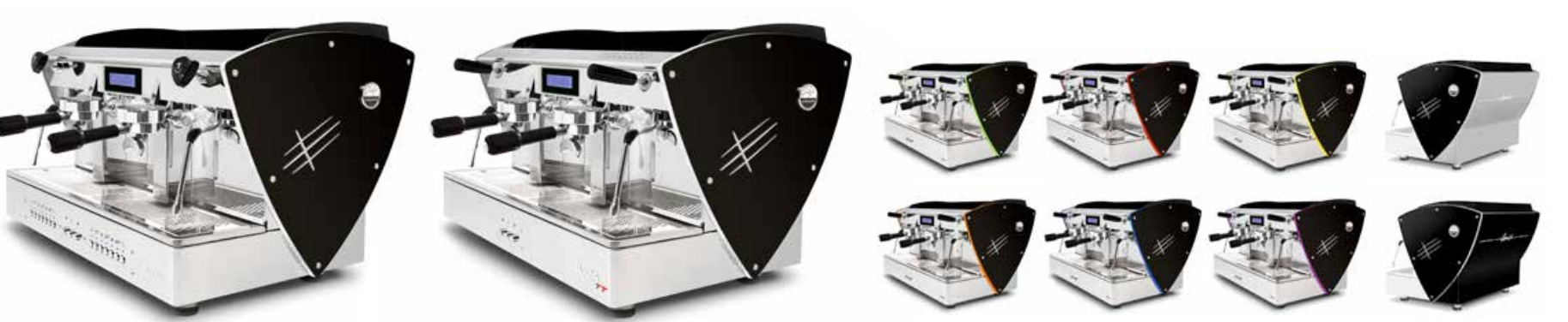
black matt transparent methacrylate