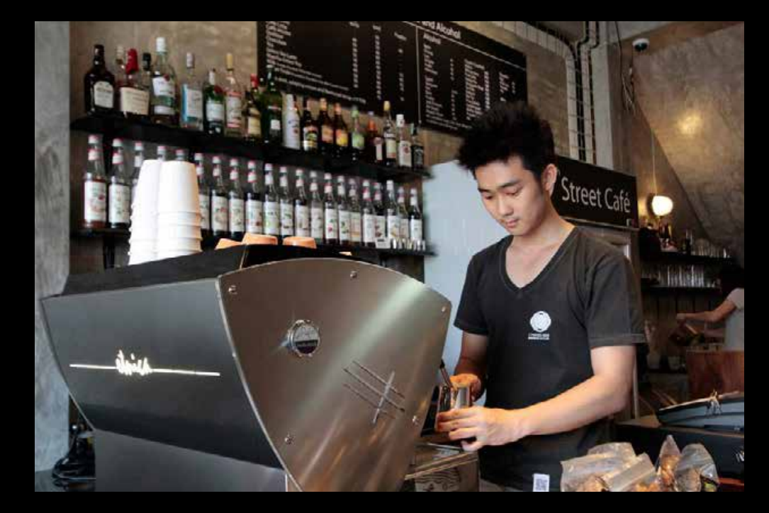
9 Street - Chiang Mai - Thailand