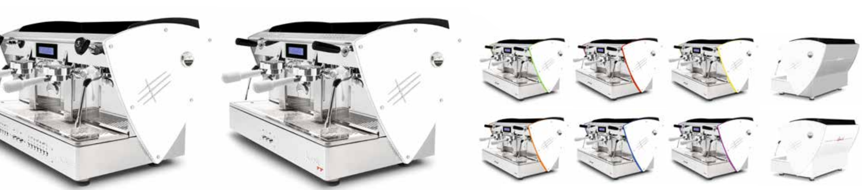
white matt transparent methacrylate