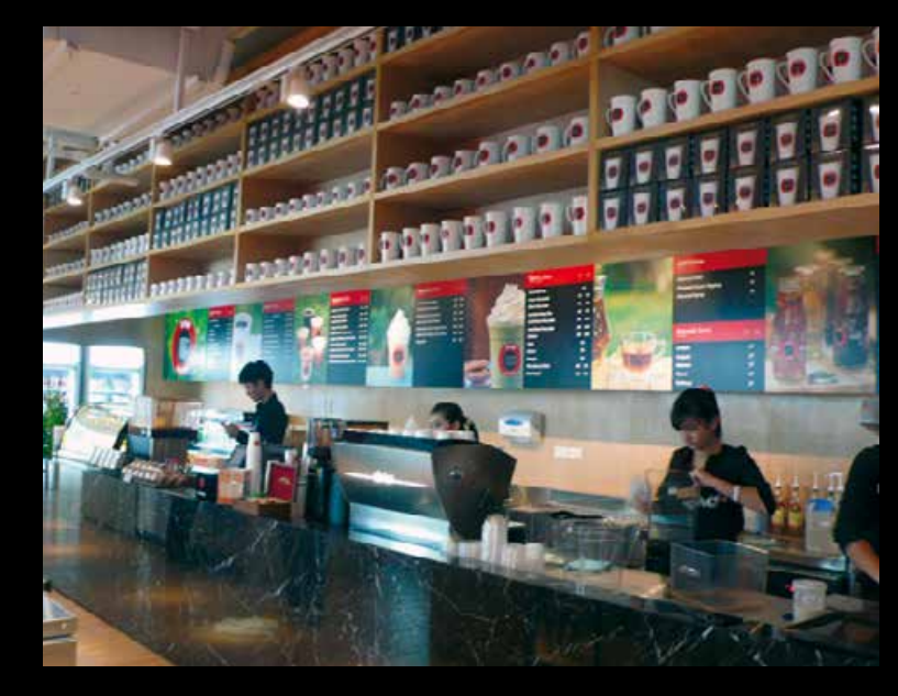
Bangkok - Thailand