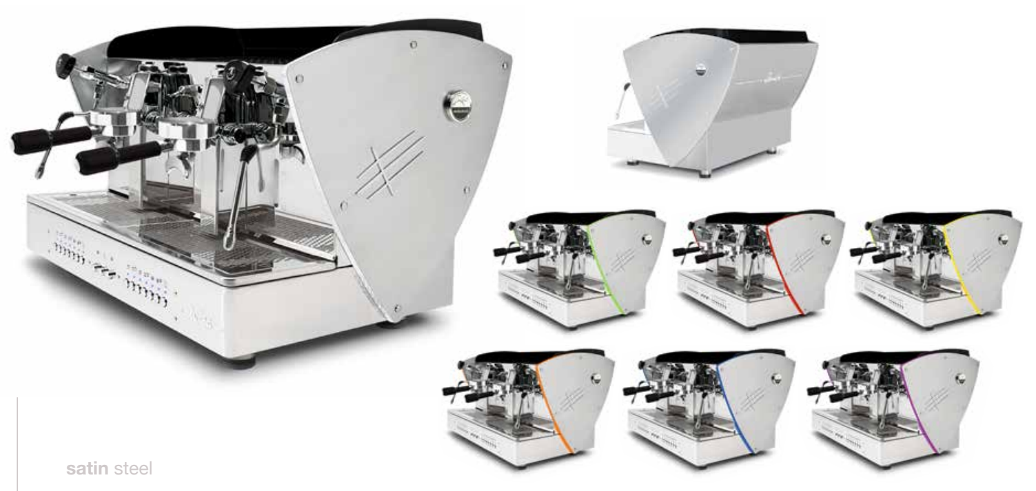
black / white / green / red / yellow / orange / blue / violet methacrylate