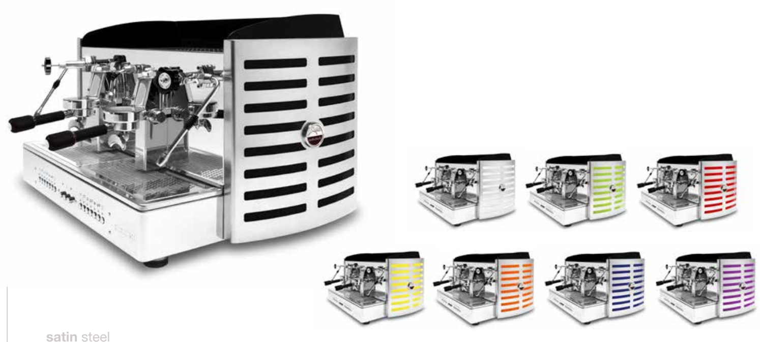
green / red / yellow / orange / blue / violet / mirror gold and mirror silver methacrylate