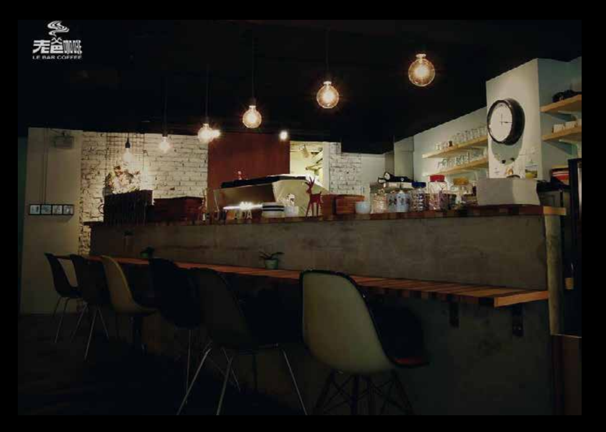
A Day Café - Taipei - Taiwan