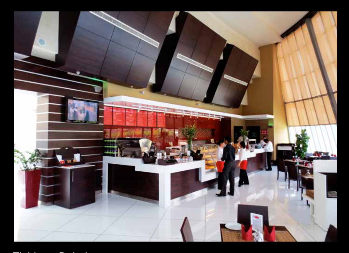
Tichino - Dubai