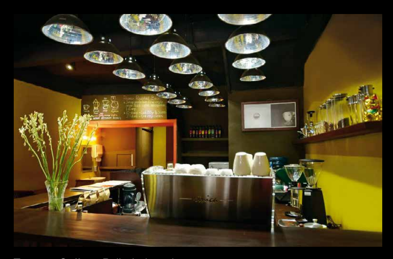
Treasure Coffee - Bali - Indonesia